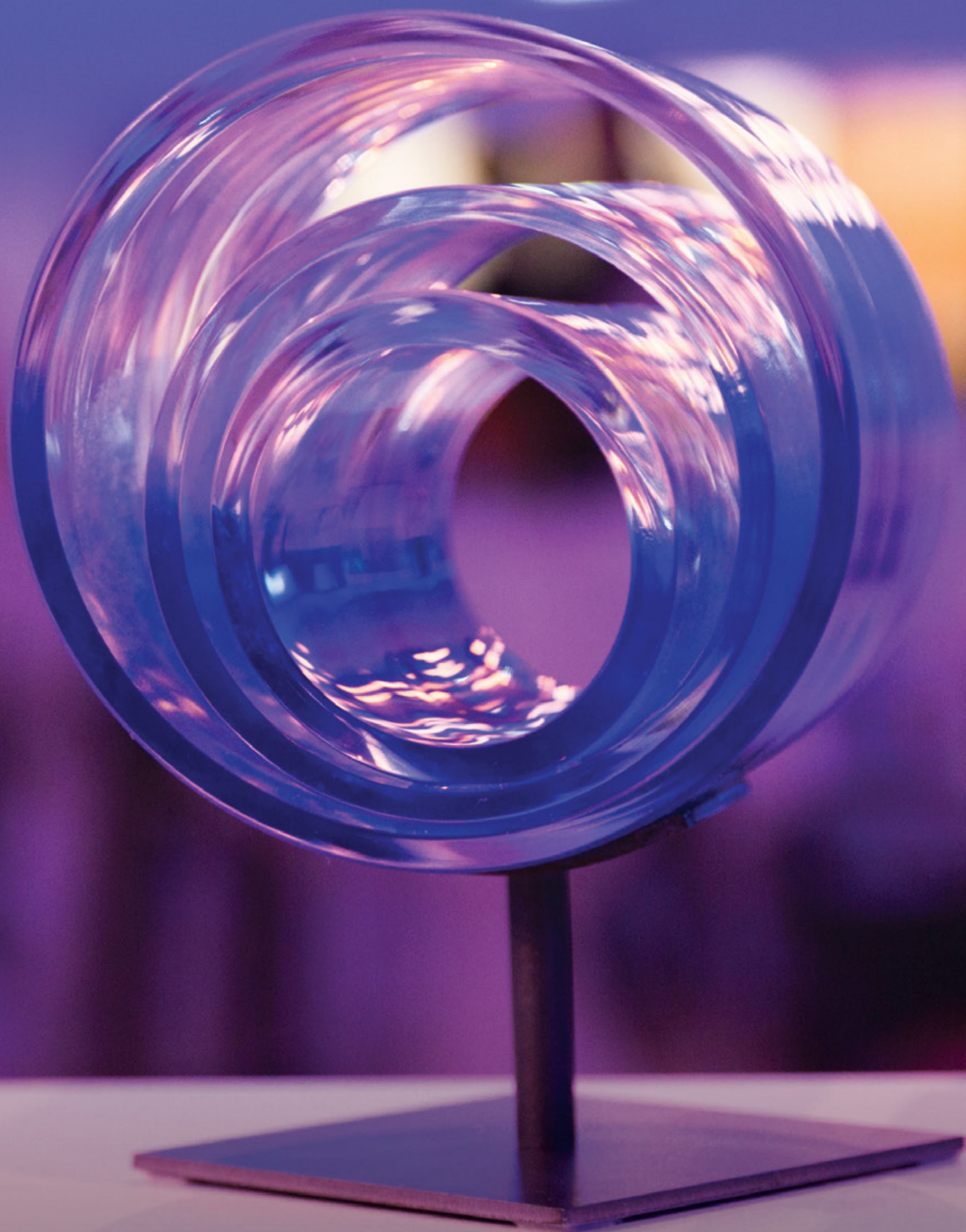
The Circulars award ceremony took place during the World Economic Forum Annual Meeting in Davos, 16 th January 2017. The bespoke designed trophy is created from 100% recycled glass.